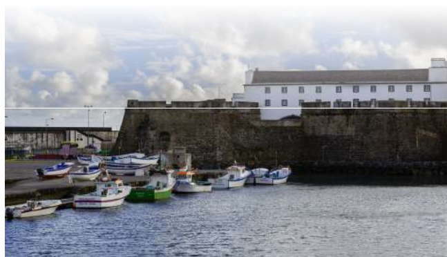
Forte de São Sebastião