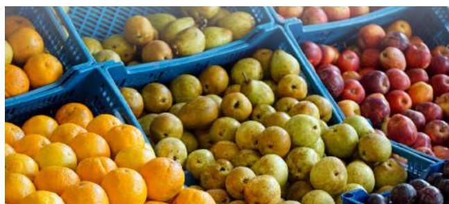
Local Azores Market