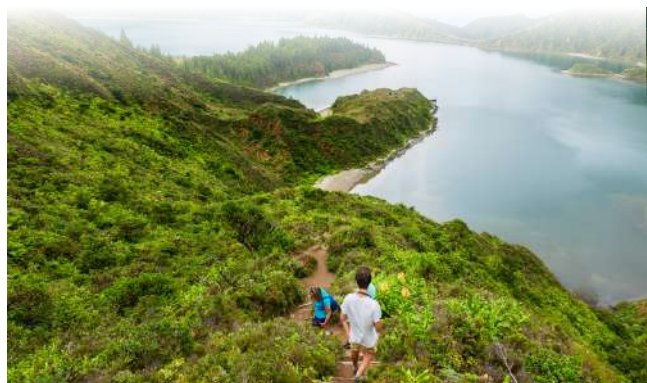
Lagoa do Fogo